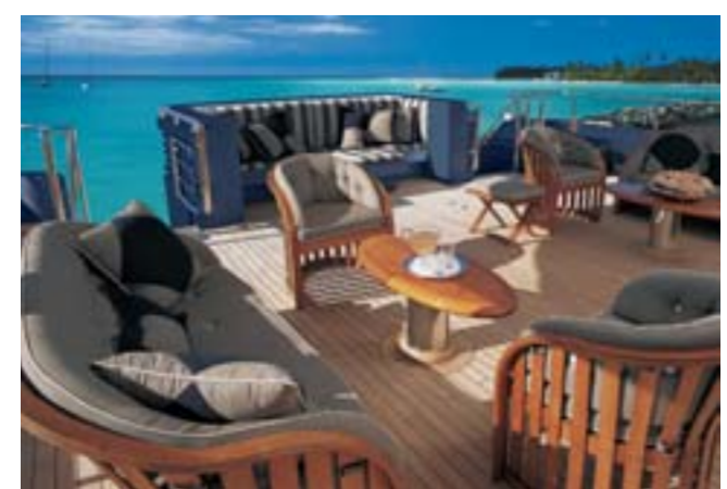
■ A&R 6466 (Above) Abeking & Rasmussen, April 2005 45m (147"), 12 guests 2 x 1,087hp MTU, steel hull Price: €27.95m