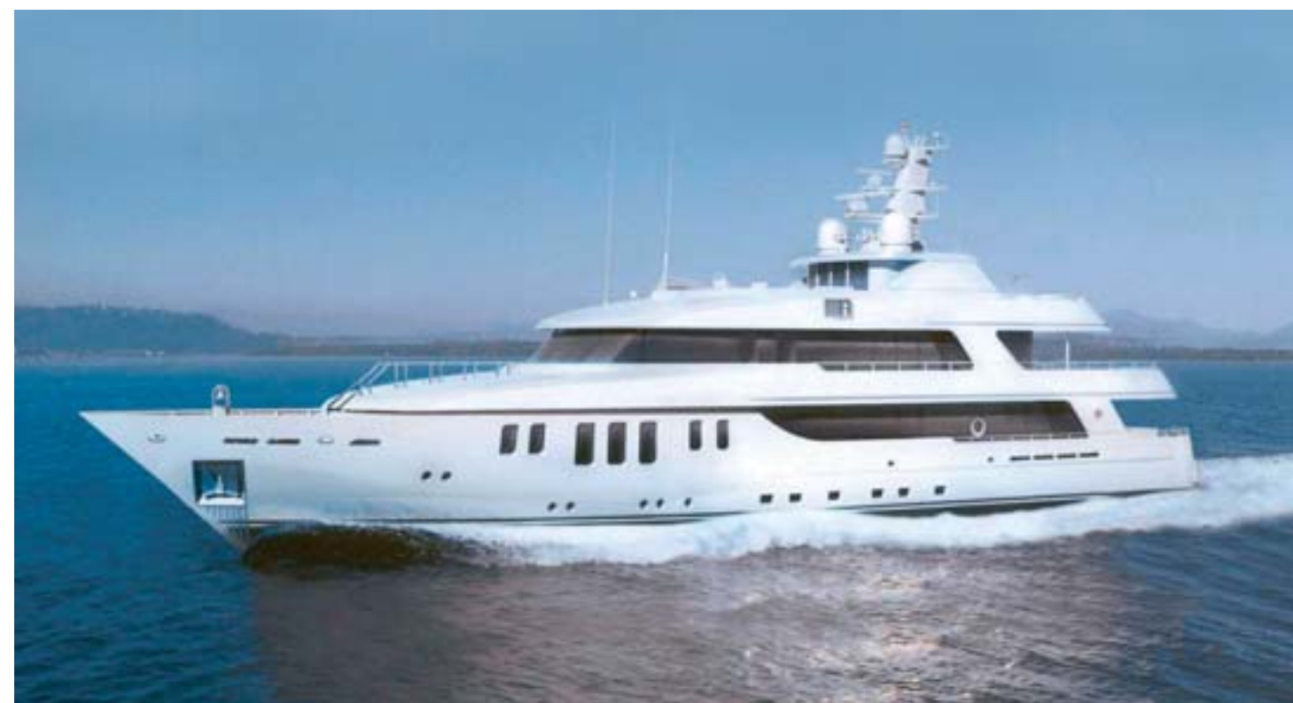
■ ALFA IV (Left) Oceanco, 2004 60m (196' 11"), 12 guests 2 x 1,650hp Caterpillar, steel hull Price: €52.5m