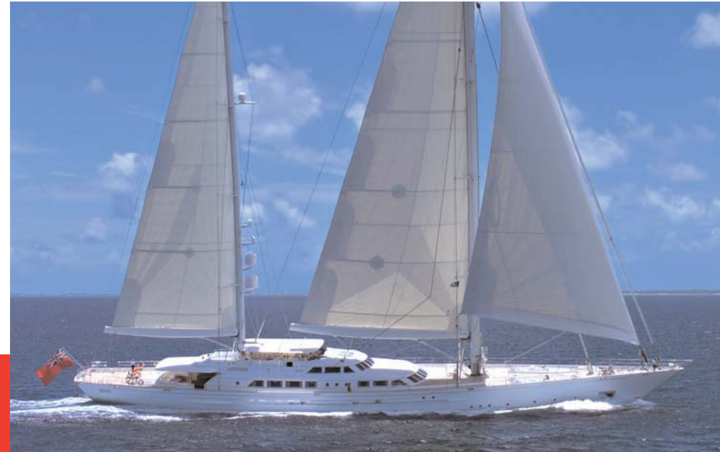
Above: Felicita West. Right: Domani. Right, below: Golden Odyssey. Below: Talitha G. Far right: Red Dragon.

In the Caribbean, Edmiston has motor yachts Talitha G and Domani as well as sailing yachts Felicita West, Atmosphere and from next March, the newly refitted Salperton.